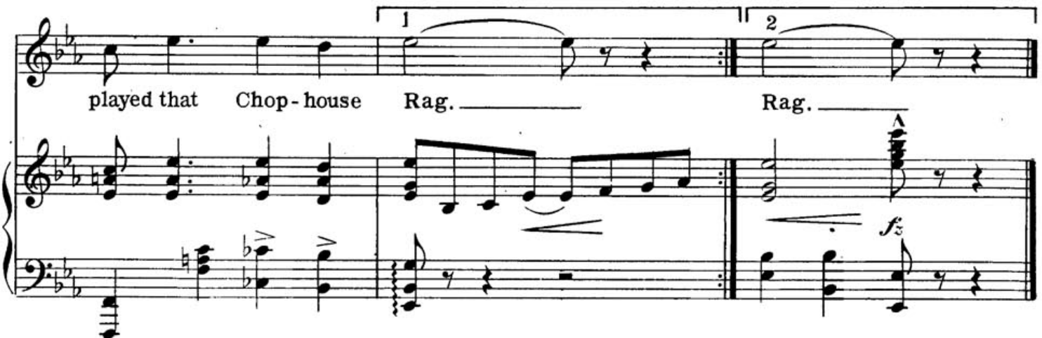
Chop House Rag. 4.