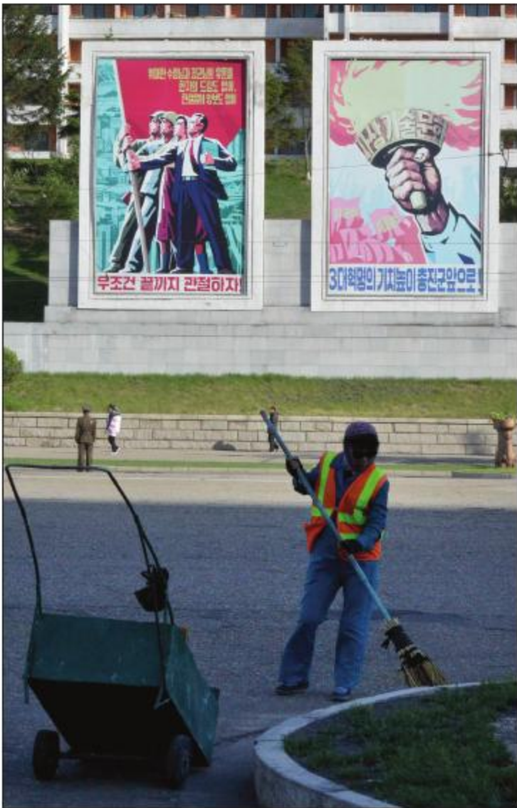
Street cleaning in Pyongyang on Wednesday, May 4, 2016, as North Koreans gear up for something they haven't seen in more than three decades — a Workers' Party Congress.