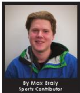
By Max Braly Sports Contributor

I laid in turmoil on my bed for a few moments immediately following the Trail Blazers' game four 132-125 overtime loss to the Golden State Warriors in the Western Conference semi-finals. I tirelessly thought about the countless opportunities the Blazers had missed, and I couldn't help but play the 'what if' game.