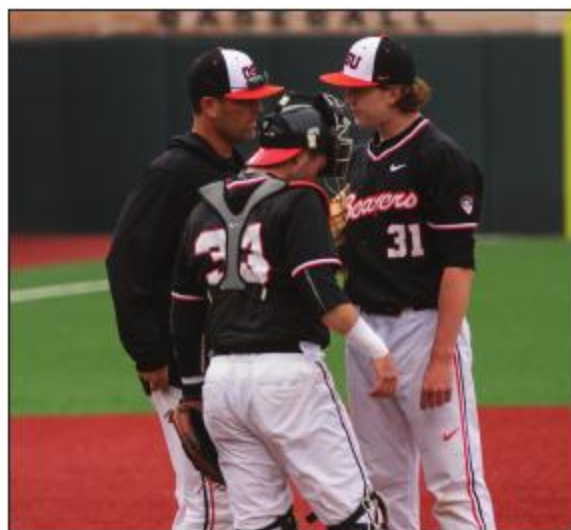
JOSHUA | THE DAILY BAROMETER