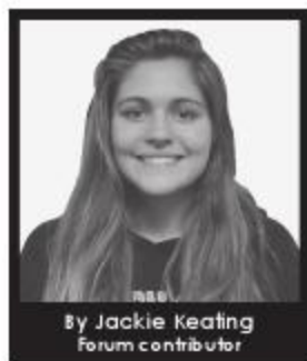
By Jackie Keating Forum contributor

Summer vacation is approaching rapidly, and if you're finding yourself without summertime responsibilities, you may be feeling the itch to travel. Of course, travelling can be pricey, but if you're open to destination options and would just like a change of scenery for a bit, I've compiled a list of destinations both domestic and international that you can fly to fairly inexpensively out of our own dear Portland International Airport.