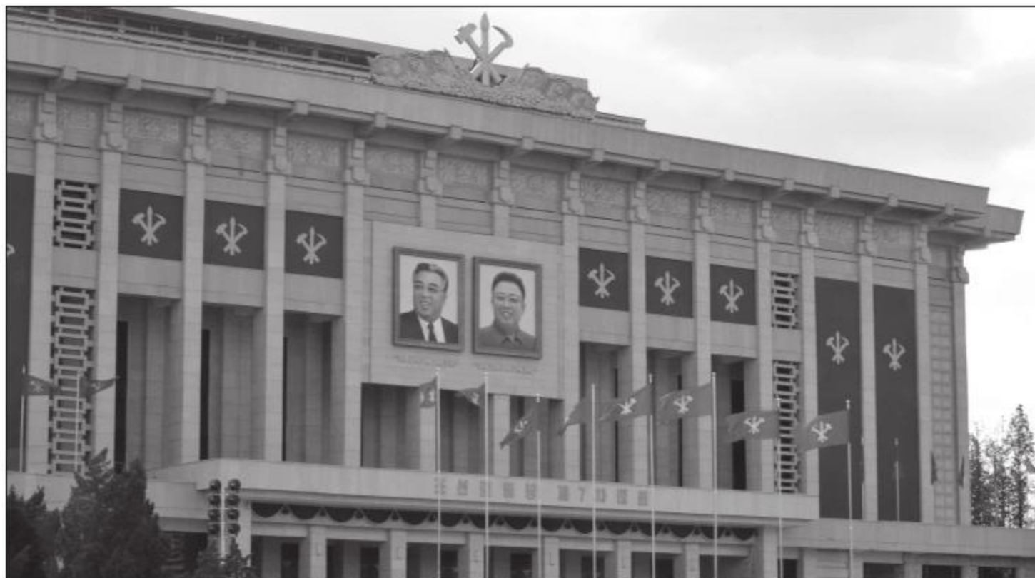
JULIE MAKINEN | LOS ANGELES TIMES

Corporate registration agents like Mossack Fonseca, the Panama law firm whose 11.5 million leaked documents comprise the Panama Papers archive, earn extra fees when they stock the boards of offshore entities with nominees who