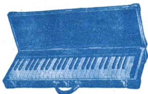
FOUR OR TWO OCTAVES

Instruments for use in traveling. Strongest, best and lightest made.