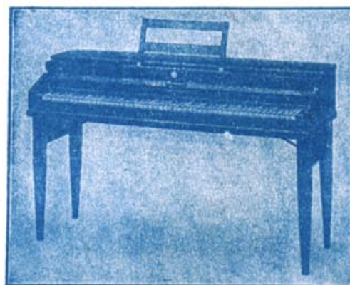
NEW IMPROVED BERGMAN CLAVIER

Players easily keep a large repertoire ready to play while advancing with new work. Instruments perfect in touch and action.