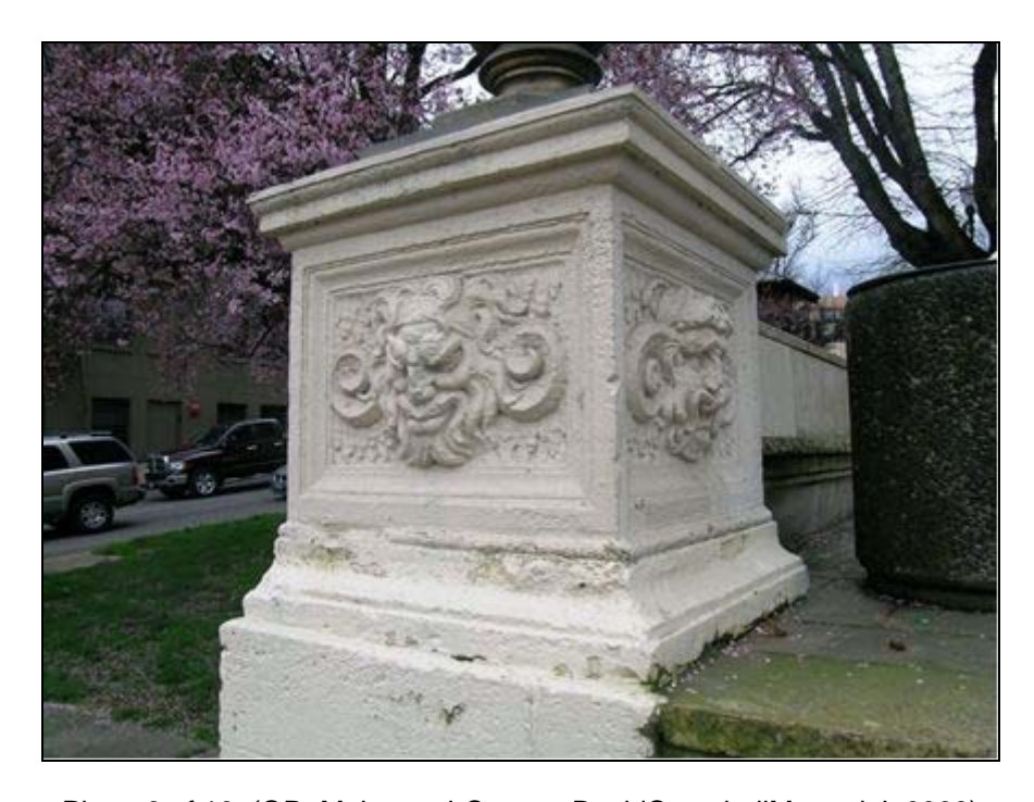
Photo 9 of 10: (OR_MultnomahCounty_DavidCampbellMemorial_0009) Lantern pedestal, camera facing south.