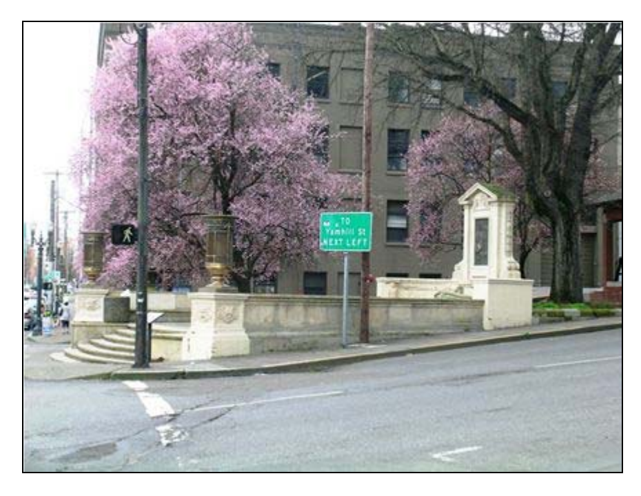
Photo 4 of 10: (OR_MultnomahCounty_DavidCampbellMemorial_0004) West elevation, camera facing east.