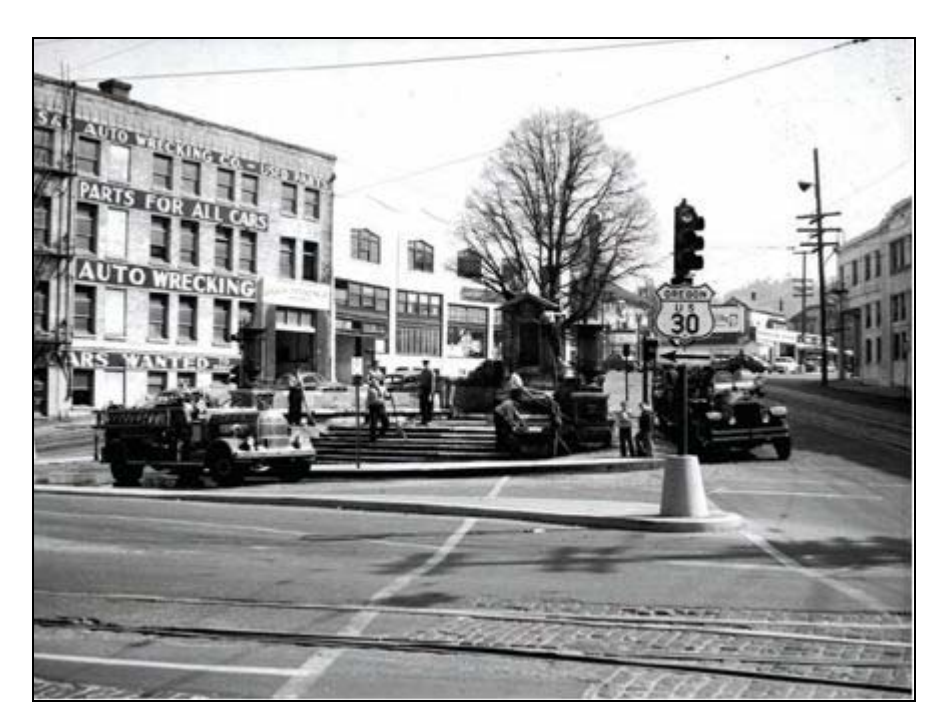
Figure 5: Historic Photograph, Station 3 crews cleaning the Campbell Memorial at West Burnside and 19th Ave., 1948.

David Campbell Memorial Name of Property Multnomah Co., Oregon County and State Not Applicable Name of multiple listing (if applicable)