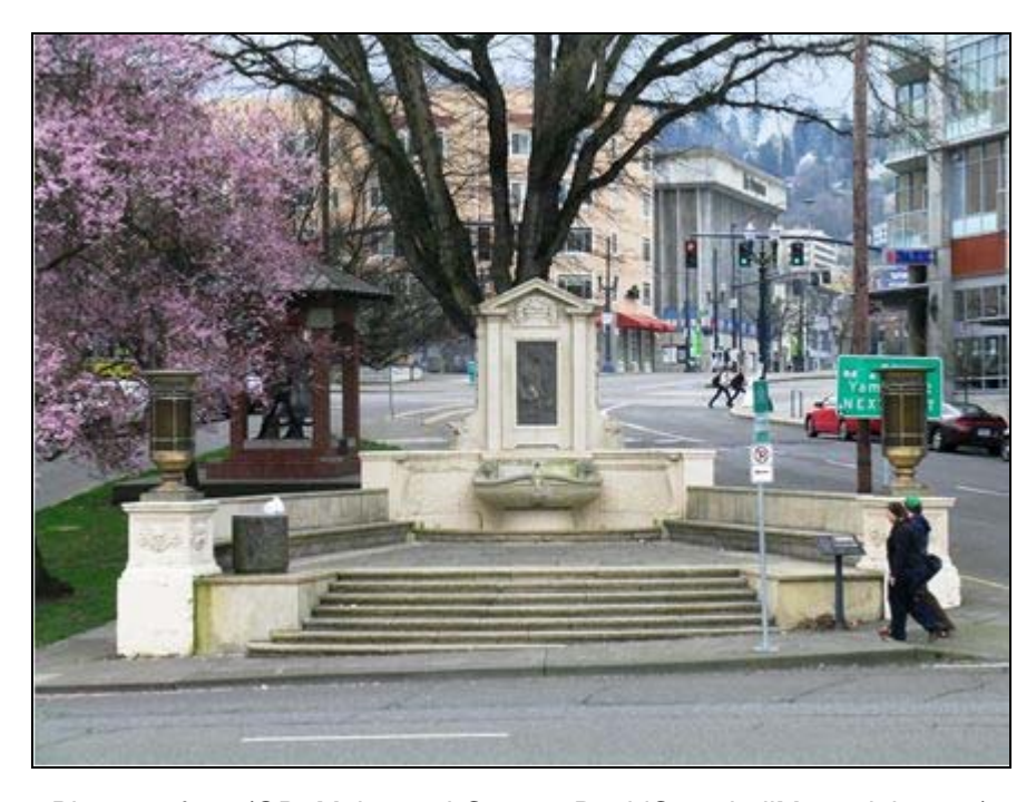
Photo 1 of 10. (OR_MultnomahCounty_DavidCampbellMemorial_0001) North elevation, camera facing south.