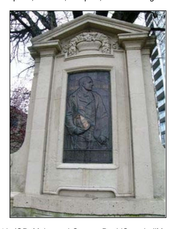
Photo 6 of 10: (OR_MultnomahCounty_DavidCampbellMemorial_0006) Sculpture and architectural surround, camera facing south.