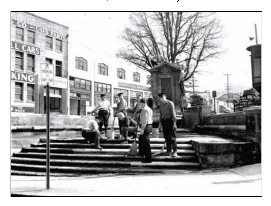
Figure 6. Historic Photograph, Station 3 crews cleaning the Campbell Memorial (close-up) at West Burnside and 19th Ave., 1948.