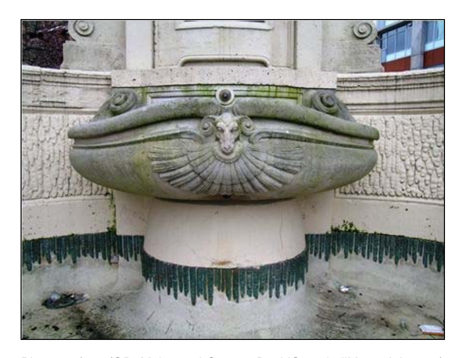
Photo 7 of 10: (OR_MultnomahCounty_DavidCampbellMemorial_0007) Fountain, camera facing south.