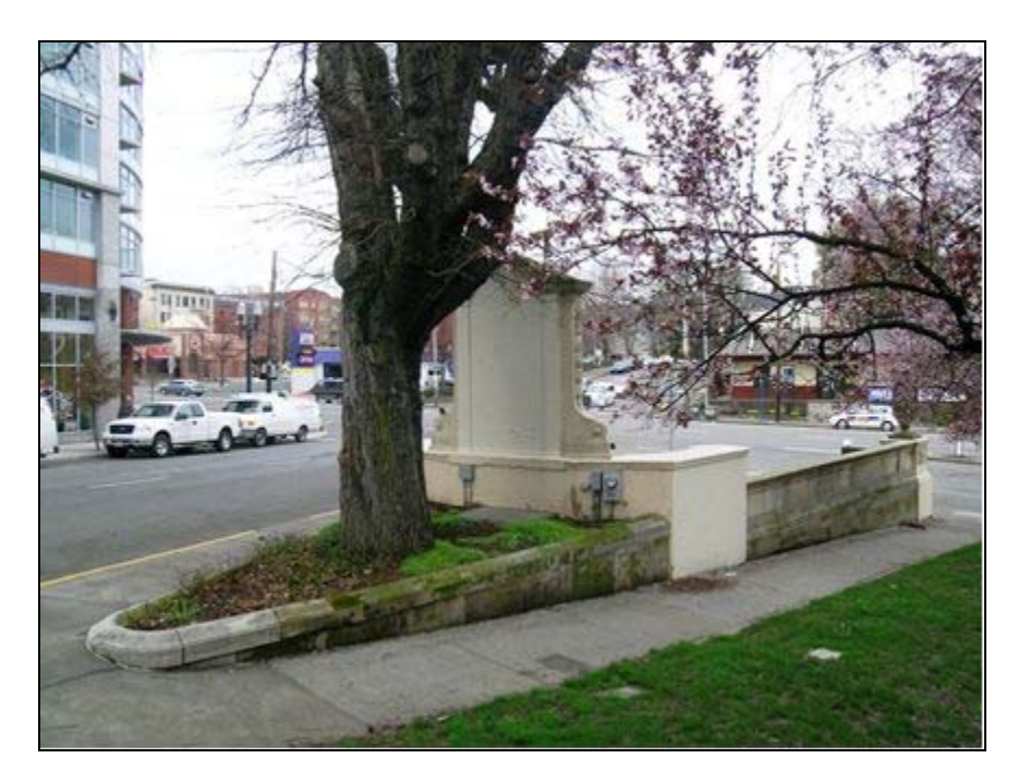
Photo 3 of 10: (OR_MultnomahCounty_DavidCampbellMemorial_0003) South (rear) elevation, camera facing north.