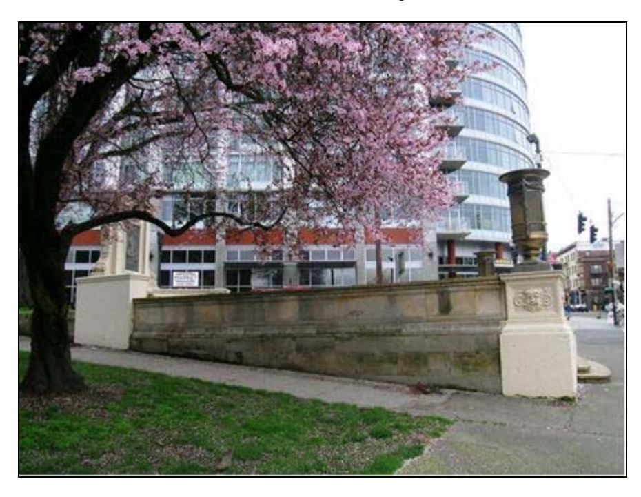
Photo 2 of 10: (OR_MultnomahCounty_DavidCampbellMemorial_0002) East elevation, camera facing west