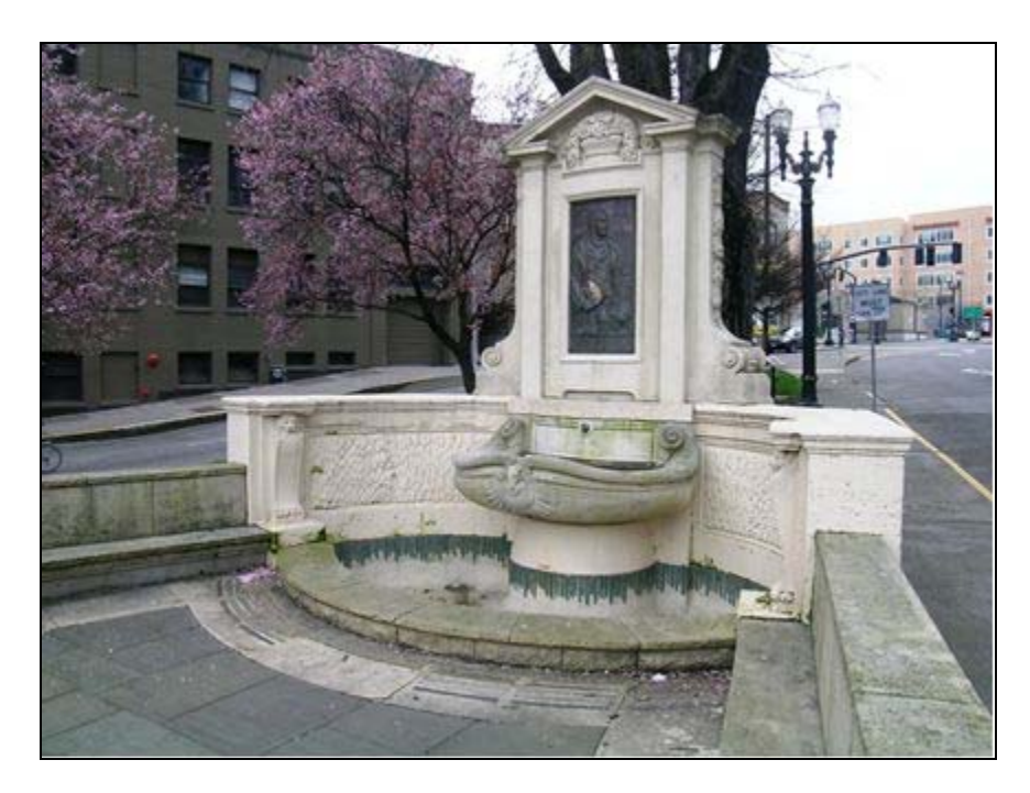
Photo 5 of 10: (OR_MultnomahCounty_DavidCampbellMemorial_0005) Sculpture, fountain, and pool, camera facing south.