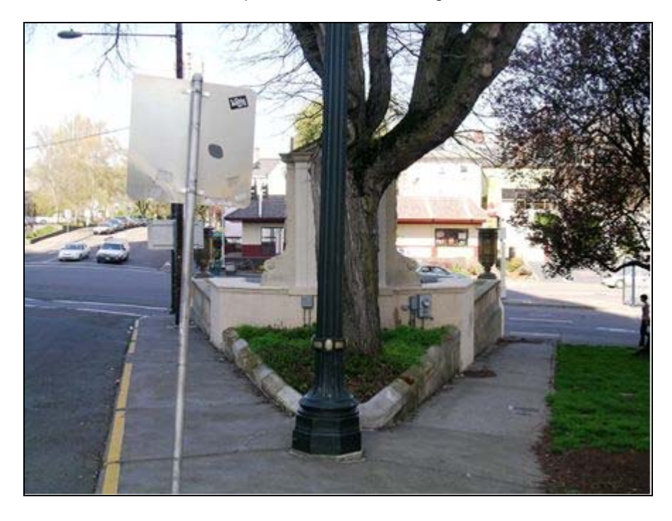
Photo 10 of 10: (OR_MultnomahCounty_DavidCampbellMemorial_0010) Rear elevation, camera facing north