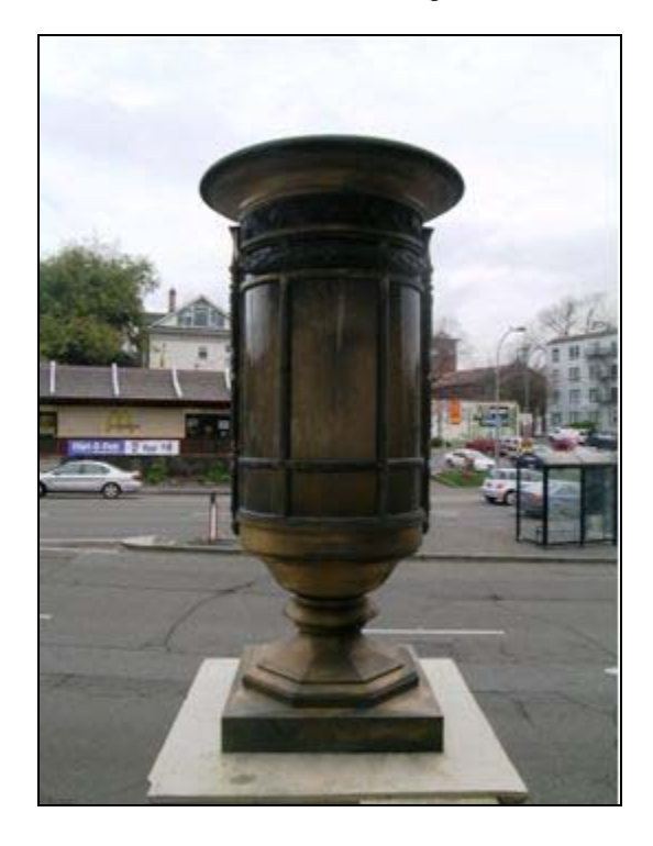
Photo 8 of 10: (OR_MultnomahCounty_DavidCampbellMemorial_0008) Lantern, camera facing north.