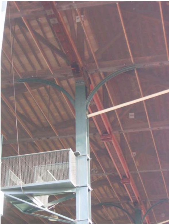
Figure 1. East Grandstand, interior detail (ceiling)