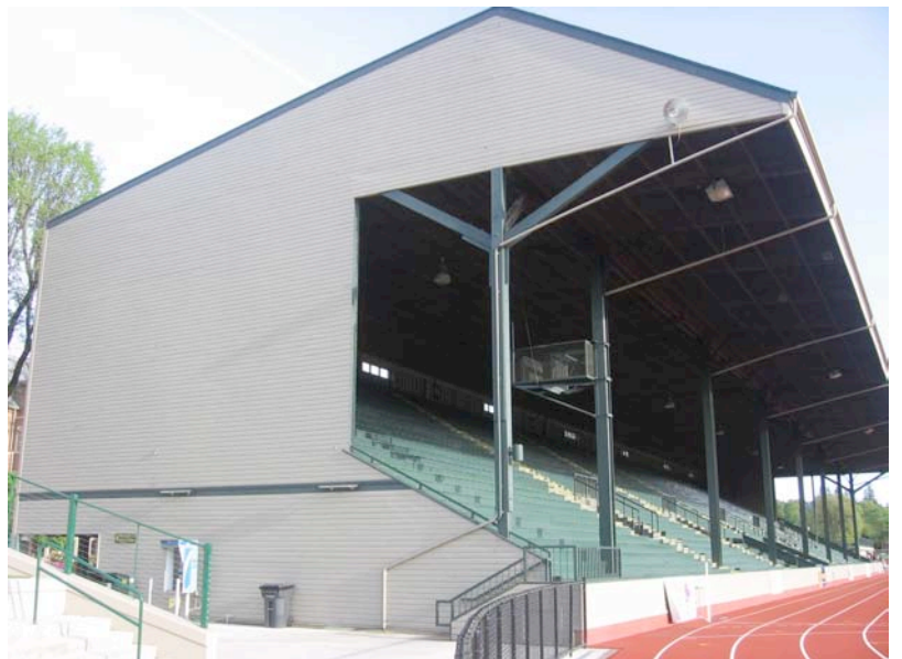
Figure 3. East Grandstand, facing south