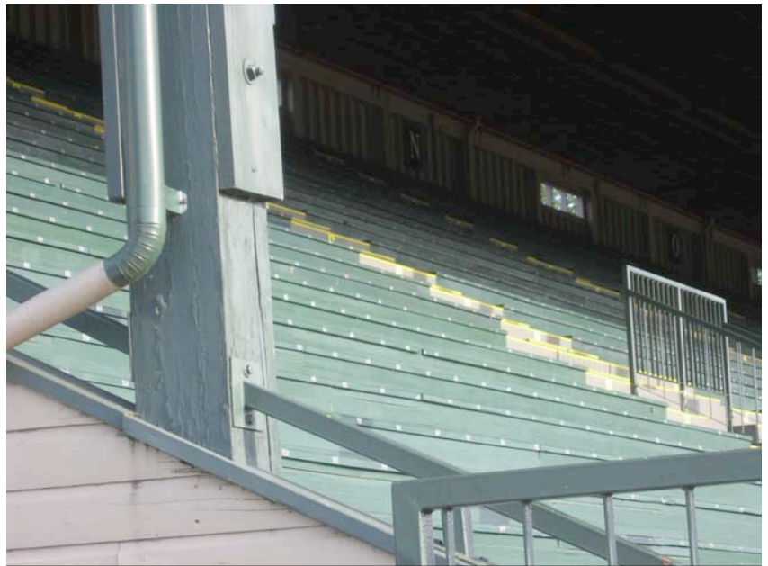
Figure 2. East Grandstand, interior detail (seating)