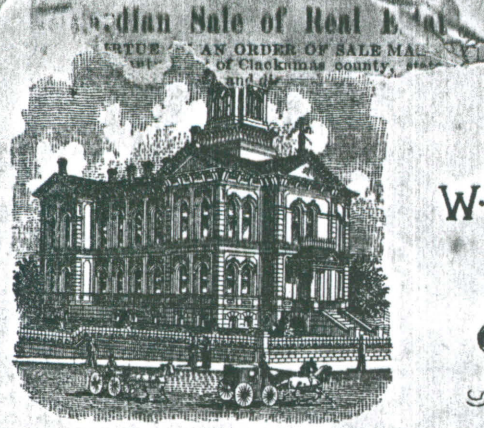
CLACKAMAS COUNTY COURT HOUSE.