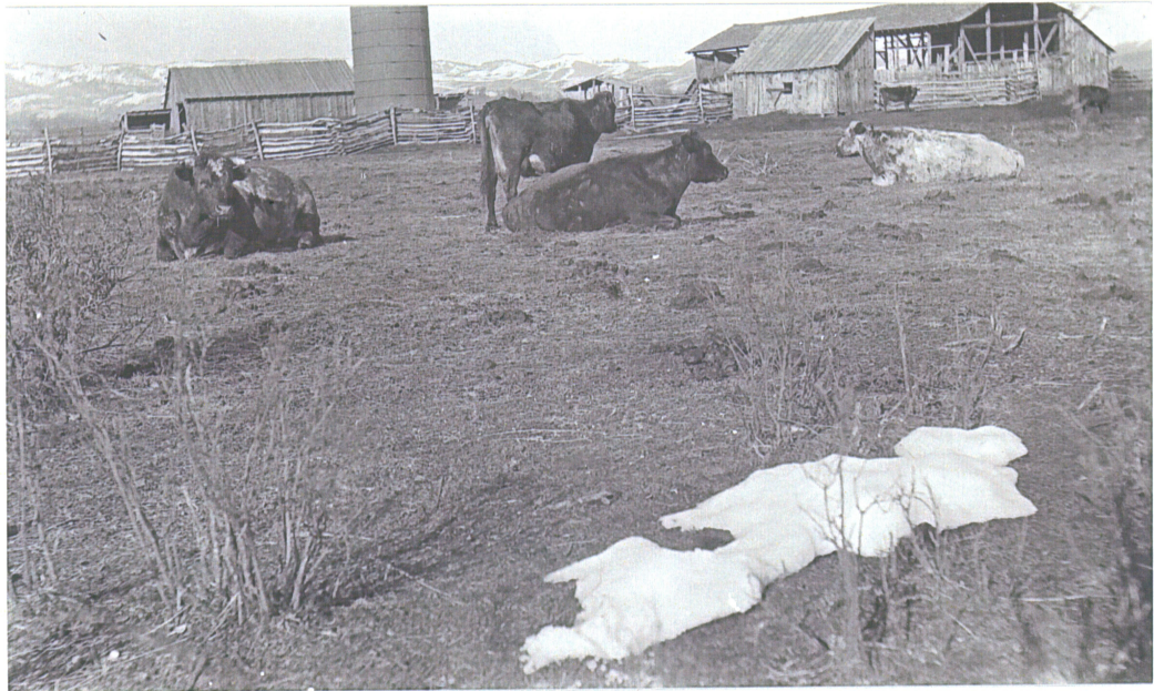
Milk cows in the pasture - the machine shed, silo, barns, corral in background.