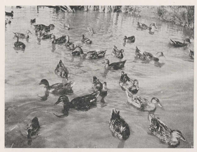
The American Nature Association Stands for the Conservation of Waterfowl