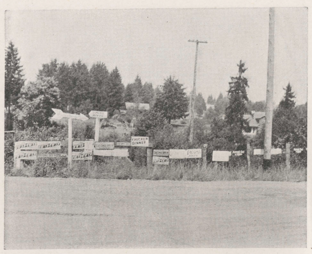
Roadside Beautification is an American Need all over the Nation