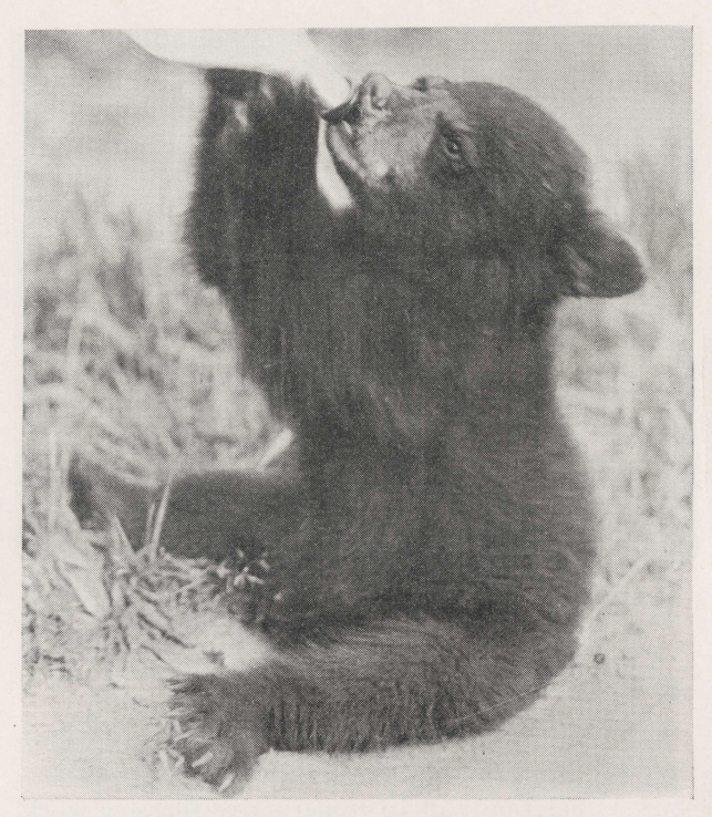
Breakfast in the Nursery of an Orphaned Bear