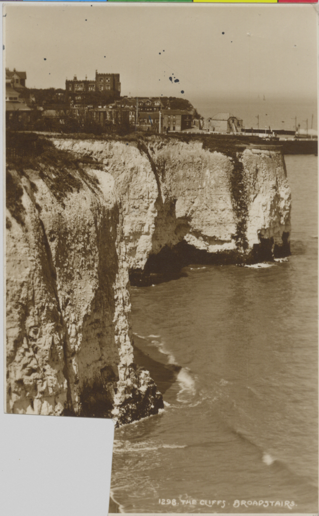
1298. THE CLIFFS - BROADSTAIRS.