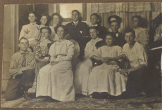
Group photo Plummer