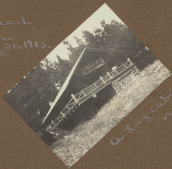
A log cabin at Mye Beach.