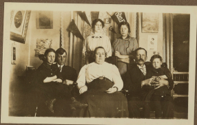
In the house