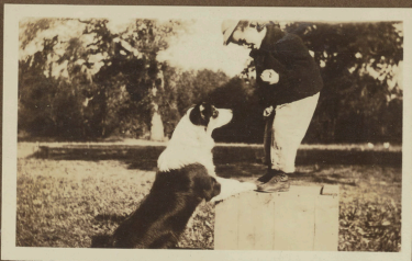
Silver and Elmer