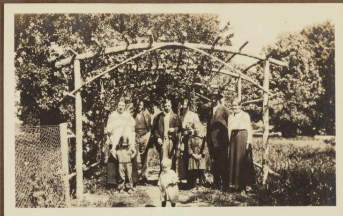
with + 105