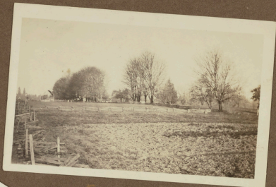
East of Oak Ridge