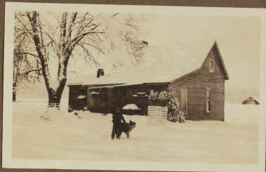
Elmer and Elmer Elmer + Elmer