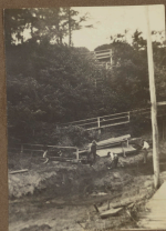
Big zig walk.