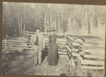
at the lumber