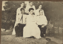
W.B. Curran make