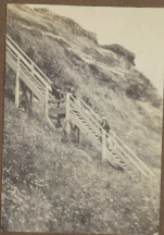
Steps up to the old lighthouse.