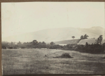
Scenes along the Coos Bay & Eastern, between Albany and Yreka.