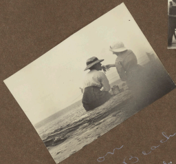
Scenes on Agate Beach, Newport, Ore.