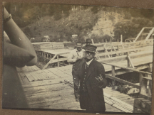
Conductor on the C. & E.