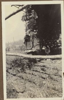
Elmer + Babe