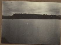
Moonlight on Yaquina Bay.