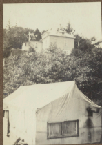
a view from the big hill.