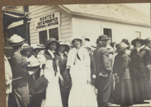
waiting for the boat.