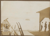
The dock at Newport with the Newport coming in the distance.