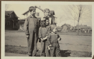
Elmer + Elmer + Elmer