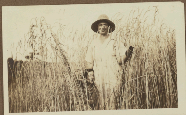
Low + almost all the way