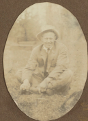
one of my friends