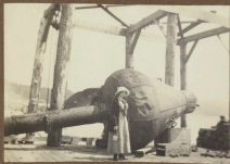
A Buoy that was in the ocean showing vessels the channel.