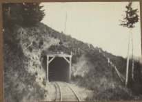
Two tunnels on the C. & E.