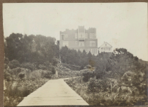
The Castle Studio, Mye Beach.