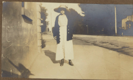
one of my friends