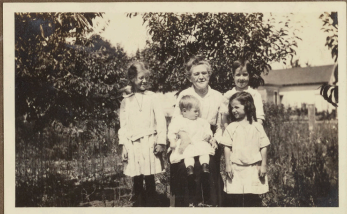
Grandmother with granddaughters