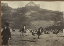
Scene on Nye Beach.