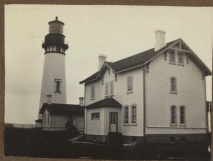
The light house on Cape Foulweather.