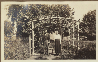
with + Aunt + Uncle