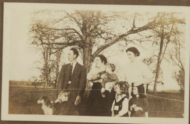
Elmer + Elmer + Elmer