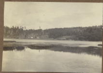
Scene at Oysterville.