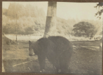
Mother Bear and her cub in tree.