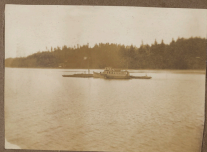
A barge crossing Yaquina Bay.