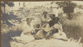
one of my friends