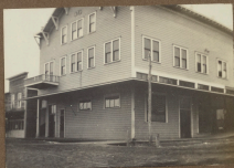
The Post office