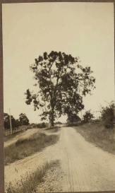
Tree on road 1100