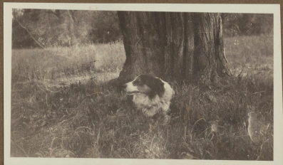
Low + almost all the way