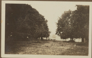
Low + almost all the way