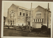
Methodist Church Spencer