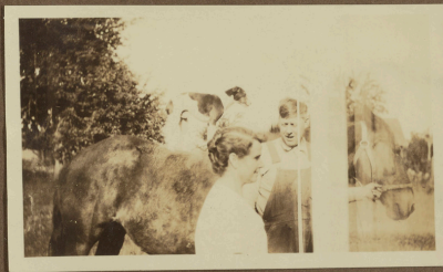
Propts at Lebanon