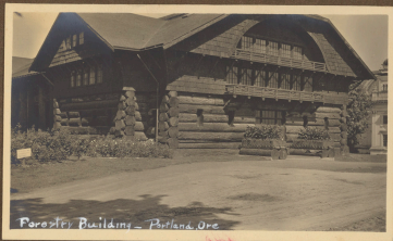
Poretti Building - Portland, Ore