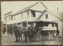
The hack that took us to the light house.