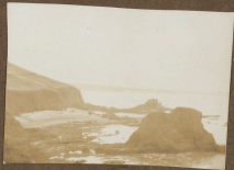
Lion Rock near light House.