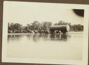
Jolly W. Boyd and with some water pipe