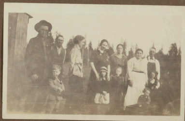
Elmer + Elmer + Elmer Elmer + Elmer + Elmer Elmer + Elmer + Elmer