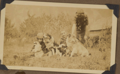
3/11/20 2000 Down at Siuslaw at the Boron home