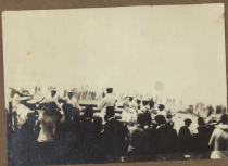
Band concert on Mye Beach Sunday afternoon July 26, 1913.