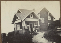
Ocean home at Neptune Beach.