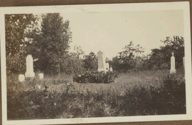
Low + almost all the way