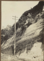
a high bank along this hill