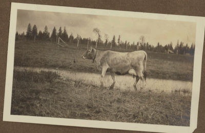
cow named Deer