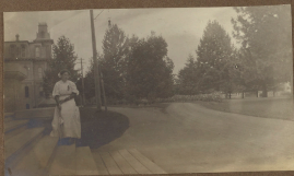
one of my friends