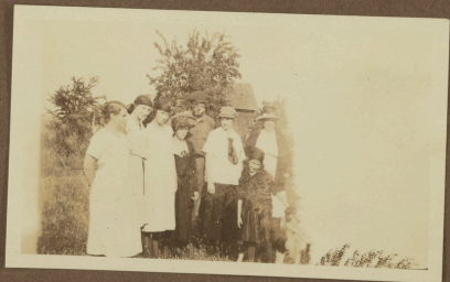
Propts + Levans at Lebanon Ore