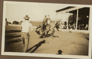
Bend Race track