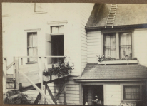
The Mignak cottage where we had rooms with bat roosts