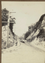
a big hill which is one of Newport's main streets.