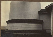
The base of light house which is 25 ft. into the ground & solid cement.