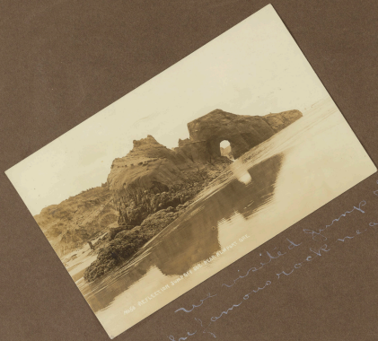
We visited jumps off for the famous rocks near the Beach