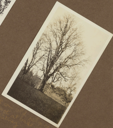
Oak with yellow