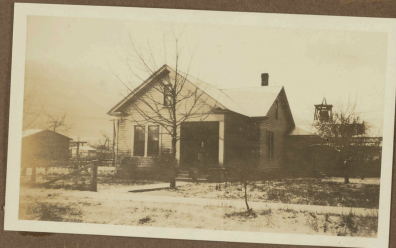
House at 212