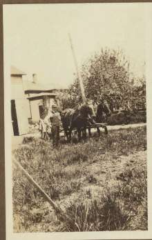
Babe and Bird team