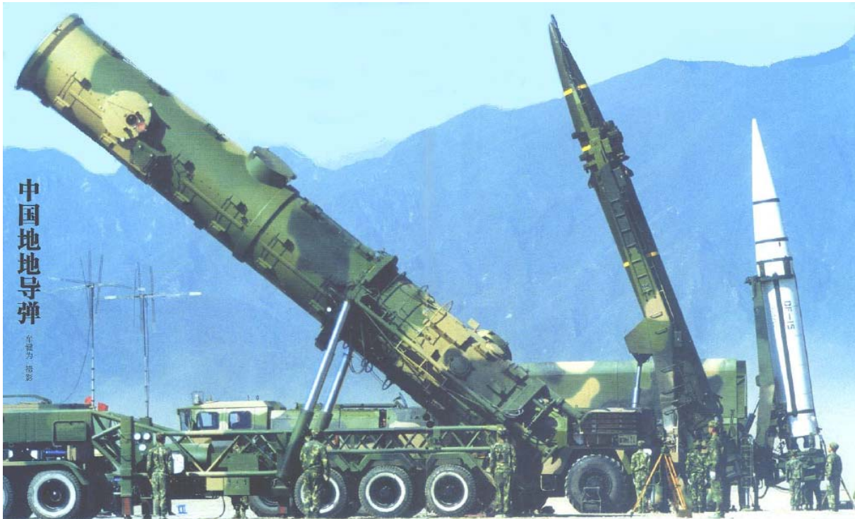
China maintains various types of conventional ballistic missiles.

Beijing's growing conventionally armed missile force provides China with a military capability that avoids the political and practical constraints associated with the use of nuclear-armed missiles. The CSS-6 and CSS-7 SRBMs provide China with a survivable and effective conventional strike force, as will future conventionally armed CSS-5s and LACMs.