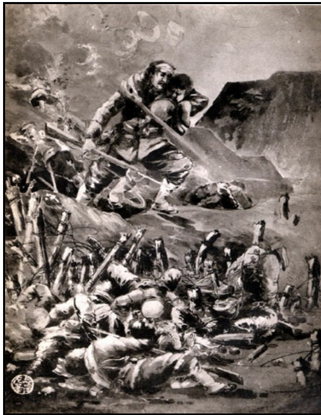
From the Painting by the Author with his Left Hand