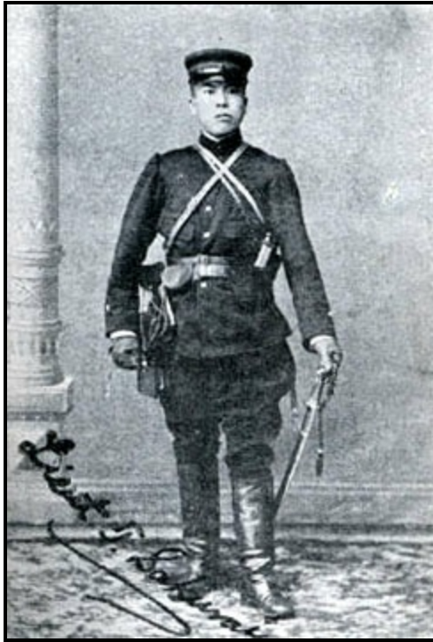
CALLED TO THE FRONT MAY, 1904