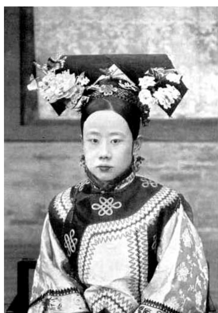
A MANCHU PRINCESS

engaged, though she had never seen him, died before they were married. After his death, but before his funeral, she dressed herself as a widow, and in a chair covered with white sackcloth went to his home, where she performed the ceremonies proper for a widow, which entitled her to take her position as his wife. Such an act is regarded as very meritorious in the eyes of the Chinese, and no women are more highly honoured than those who have given themselves in this way to a life of chastity.