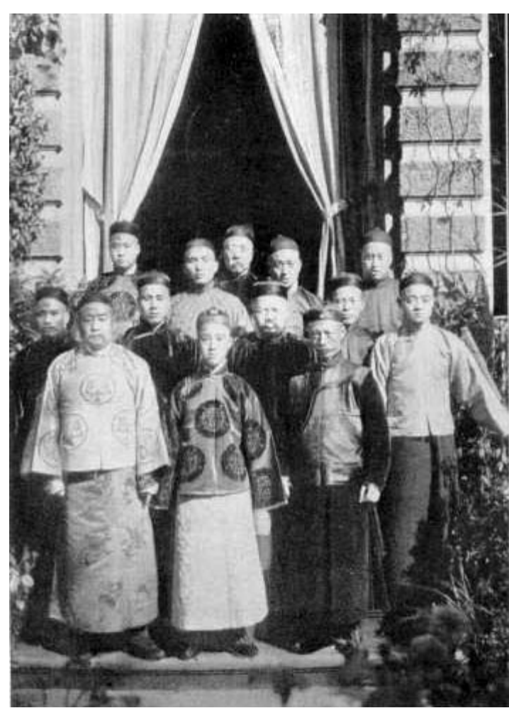
PRINCE CHUN AND HIS DELEGATION Sent to apologize to the German Emperor for the murder of Baron von Kettler

illustrated than in the case of the death of the lamented Baron von Kettler. Had it not been for this unfortunate occurrence, Prince Chun would not have been sent to Germany to convey the apologies of the Chinese government to the German Emperor, and he would thus never have had the opportunity of a trip to Europe; and the world might once more have beheld a regent on the dragon throne who had never seen anything a hundred miles from his own capital.