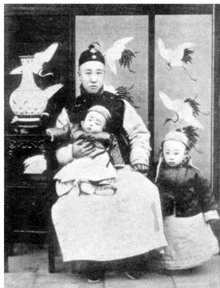
PRINCE CHUN WITH THE EMPEROR PU I ON HIS LEFT

"But we think upon our heavy responsibility and our weakness, and we must depend upon the great and small civil and military officials of Peking and the provinces to show public spirit and patriotism, and aid in the government. The viceroys and governors should harmonize the people and arrange carefully methods of government to comfort the spirit of the late Emperor in heaven. This is our earnest expectation."