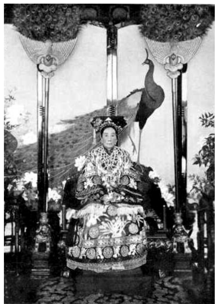
EMPRESS DOWAGER IN PEARL FRINGED ROYAL ROBES

It was he, as we have seen, who succeeded in outwitting and overthrowing the self-constituted regency on the death of his brother Hsien Feng, and, with the Empress Dowager, seated her infant son upon the throne, with the two Empresses and himself as joint regents. This condition continued for some years, with the senior Empress exercising no authority, and Prince Kung continually growing in power. The arrangement seemed satisfactory to all but one--the Empress-mother. To her it appeared as though he were fast becoming the government, and she and the Empress were as rapidly receding into the background, while in reality the design had been to make him "joint regent" with them. In all the receptions of the officials by the court, Prince Kung alone could see them face to face, while the ladies were compelled to remain behind a screen, listening to the deliberations but without taking any part therein, other than by such suggestions as they might make.