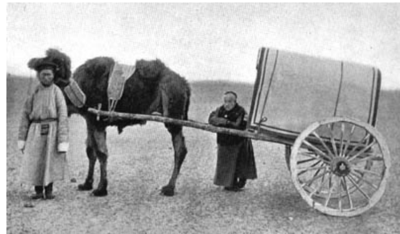
PRINCE SU AND HIS CAMEL CART

is still living, but as they were not congenial in their wedded life, the Empress Dowager made herself a kind of foster-mother to the Princess and banished her husband to Mongolia, an incident which reveals to us another phase of the great Dowager's character--that of dealing with fractious husbands.