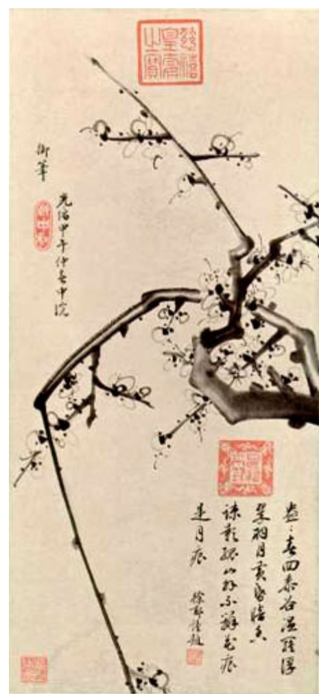
ALSO PAINTED BY THE EMPRESS DOWAGER WITH POEM AND DATE