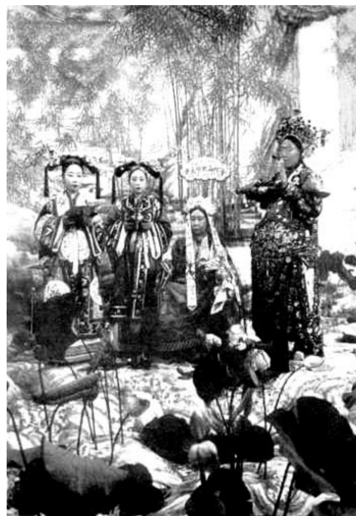
THE EMPRESS DOWAGER AS GODDESS OF MERCY Foreground and background painted by Court Artists.

One day another of the court painters came to call on me and during the conversation told me that he was painting a picture of the Empress Dowager as the goddess of mercy. Up to that time I had not been accustomed to think of her as a goddess of mercy, but he told me that she not infrequently copied the gospel of that goddess with her own pen, had her portrait painted in the form of the goddess which she used as a frontispiece, bound the whole up in yellow silk or satin and gave it as a present to her favourite officials. Of course I thought at once of my collection of paintings, and said: