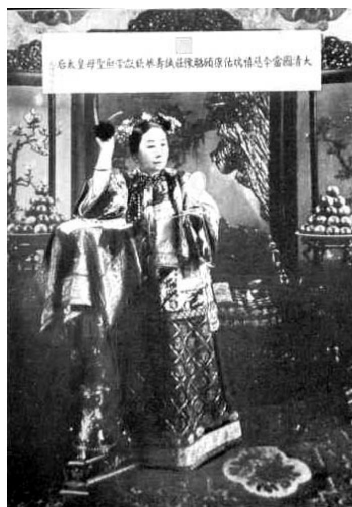
THE EMPRESS DOWAGER

It seemed very human to hear this delicate little Princess make a remark of this kind. Of course, both she and the Empress Dowager have natural feet.