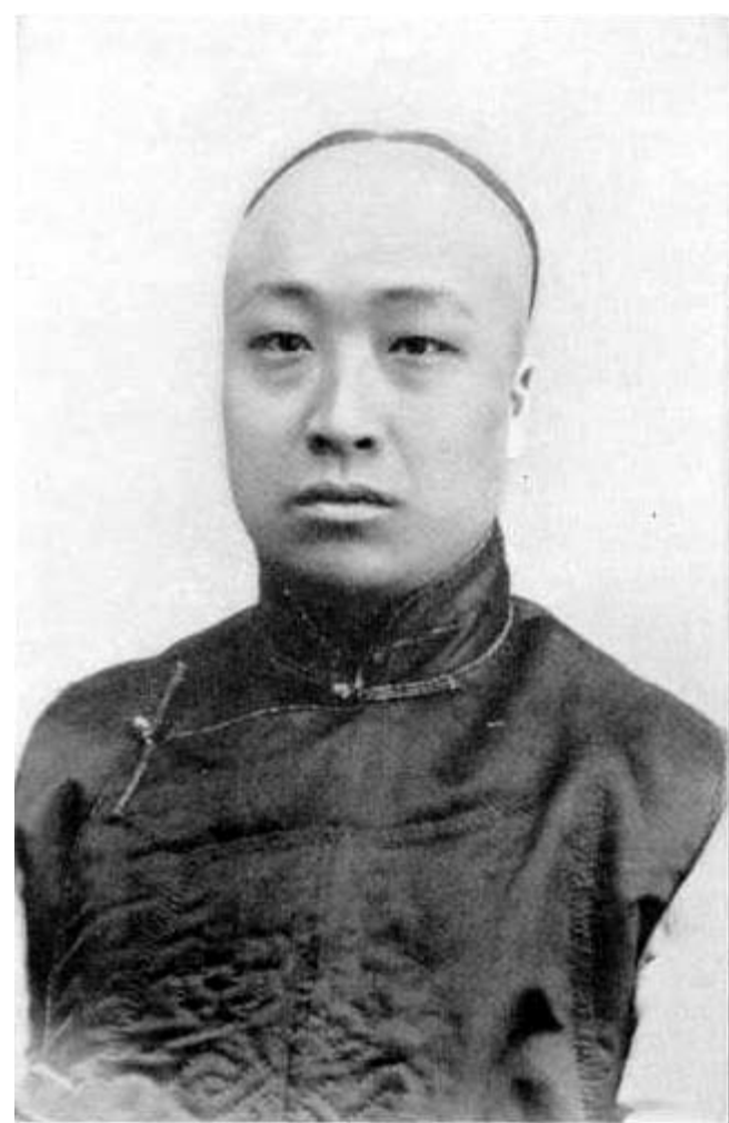
PRINCE PU LUN, IMPERIAL DELEGATE TO THE ST. LOUIS EXPOSITION

On the whole, therefore, Prince Chun begins his regency with a brighter outlook for his foreign relations than any other ruler China has ever had. What shall we say of his Chinese relations? Being the brother of Kuang Hsu, and himself a progressive young man, he ought to have the support of the Reform party, and being the choice of the Empress Dowager, he will have the support of the great progressive officials who have had the conduct of affairs for the last quarter of a century and more, and especially for the past ten years, since the Emperor Kuang Hsu was deposed.