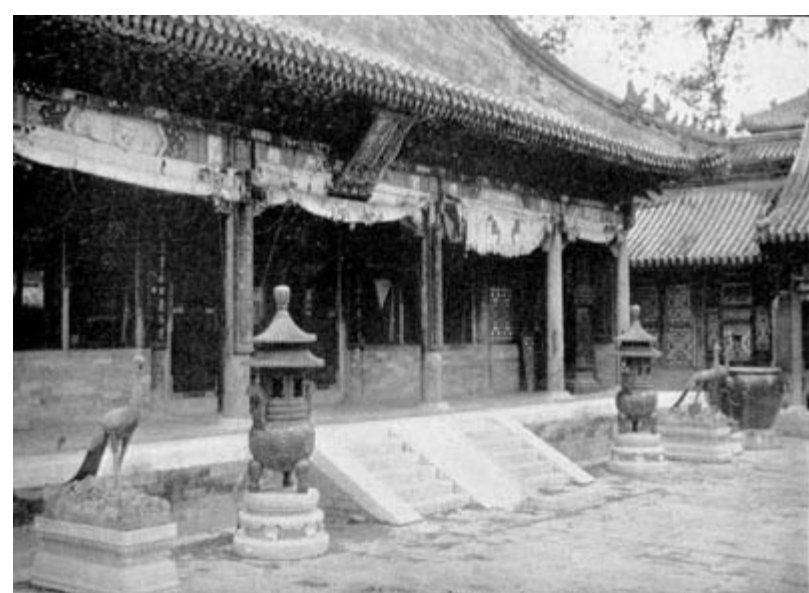
EMPERESS DOWAGER'S DINING ROOM

One was strangely impressed by what he saw here. There was no gorgeous display of Oriental colouring, but there was beauty of a peculiarly penetrating quality--and yet a homelike beauty. No description that can be written of it will ever do it justice. Not until one can see and appreciate the paintings of the old Chinese masters of five hundred years ago hanging upon the walls, the beautiful pieces of the best porcelain of the time of Kang Hsi and Chien Lung, made especially for the palace, arranged in their natural surroundings, on exquisitely carved Chinese tables and brackets, the gorgeously embroidered silk portieres over the doorways, and the matchless tapestries which only the Chinese could weave for their greatest rulers, can we appreciate the beauty, the richness, and the refined elegance of the private apartments of the great Dowager.