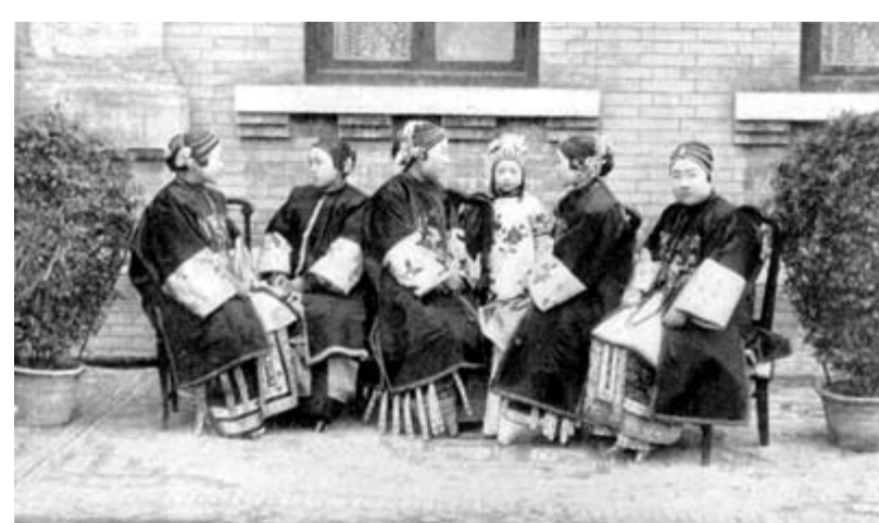
CHINESE LADIES OF RANK IN WINTER GARMENTS

"The cause dates back to the beginning of the Manchu dynasty," she responded. "When the Chinese men adopted the Manchu style of wearing the queue, it was stipulated that they should not interfere with the style of the woman's dress, and that no Chinese should be taken to the palace as concubines or slaves to the Emperor. We have therefore always held ourselves aloof from the Manchus. Our men did this to protect us, and as a result no Chinese lady has ever been received at court, except, of course, the painting teacher of the Empress Dowager, who, before she could enter the palace, was compelled to unbind her feet, adopt the Manchu style of dress and take a Manchu name."