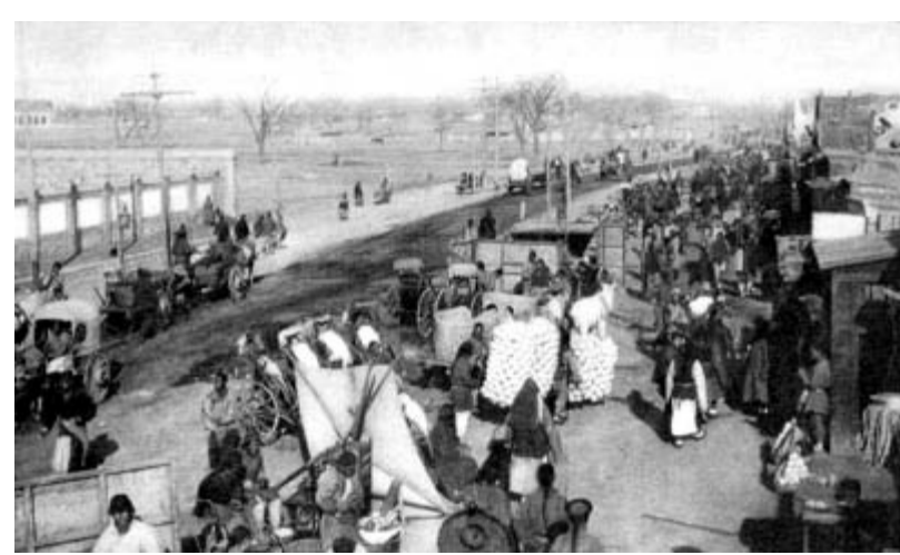
HATAMEN STREET BEFORE MACADAMIZING

hundred years ago. Here we can find the finest Oriental rugs, in a good state of preservation, with the "tone" that only age can give, made long before the time of Washington.