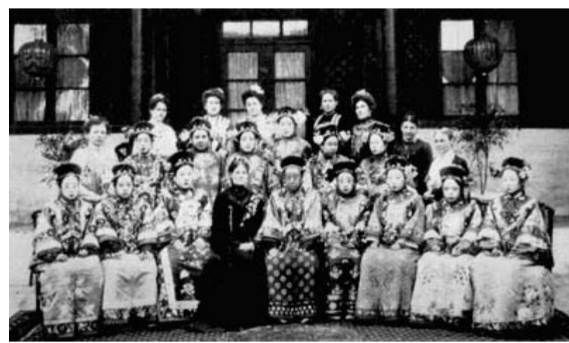
MANCHU PRINCESSES AT A LUNCHEON AT THE AMERICAN LEGATION

This was rather amusingly illustrated at a dinner given by the late Major Conger, American minister to China. Major and Mrs. Conger introduced many innovations into the social life of Peking, and none more important than the dinners and luncheons given to the princes and high officials, and also to the princesses and ladies of the court. In 1904, I was invited to dine with Major Conger and help entertain Prince Chun, Prince Pu Lun, Prince Ching, Governor Hu, Na T'ung, and a number of other princes and officials of high rank. I sat between Prince Chun and Governor Hu. Having met them both on several former occasions, I was not a stranger to either of them, and as they were well acquainted with each other, though one was a Manchu prince and the other a Chinese official, conversation was easy and natural.