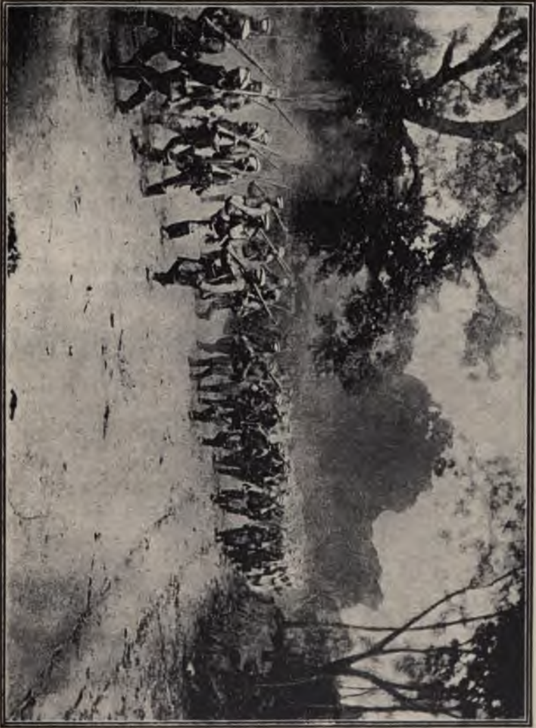
RUSSIAN INFANTRY, NEAR HO-HSI-WOO.