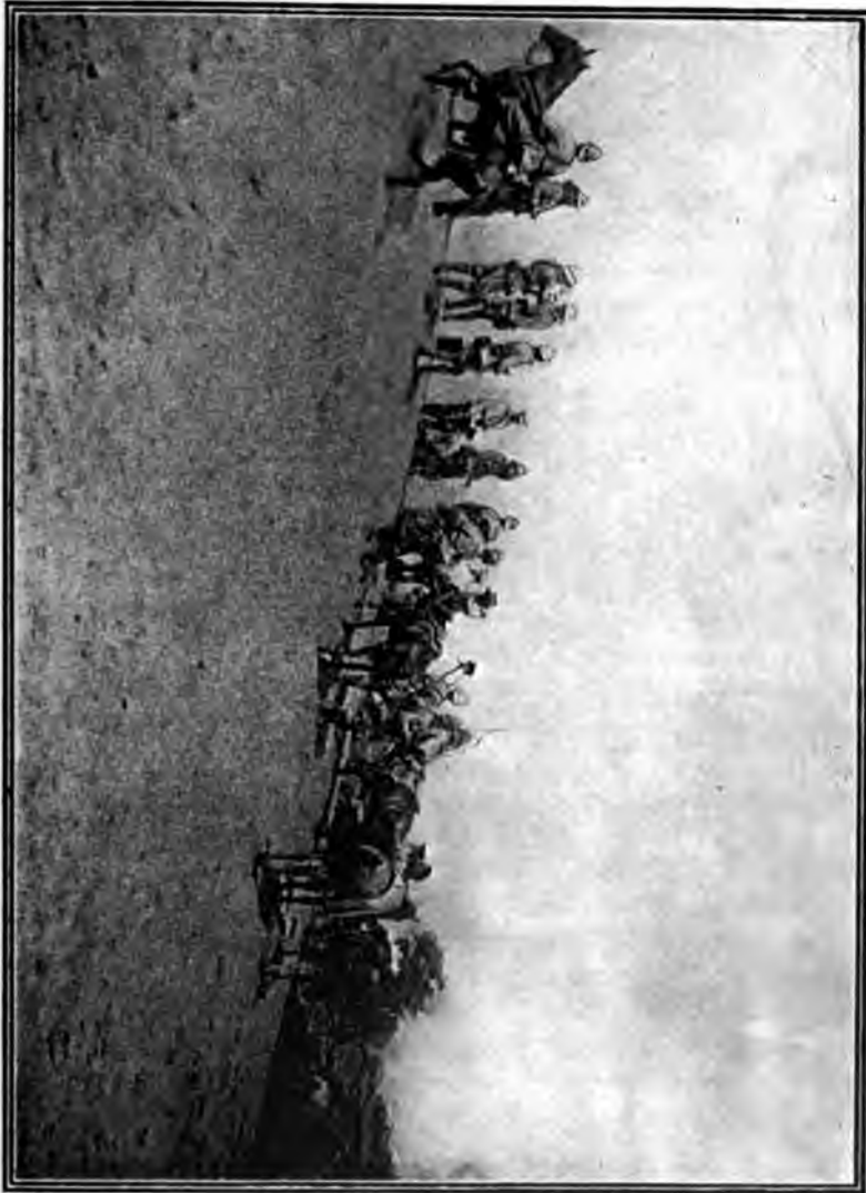
VIEW AT YANG-TSUN JUST BEFORE THE FIGHT.