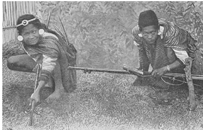
Copyright 1895, by Fleming H. Revell Company "From far Formosa"