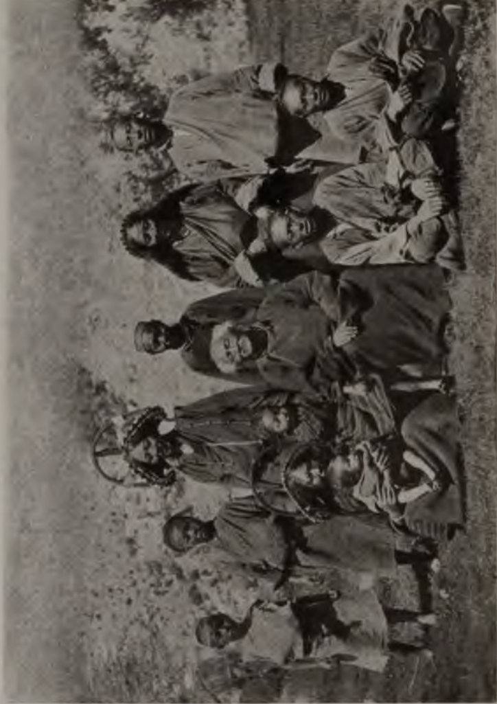
One of the Story-tellers, with his Family and Servants.