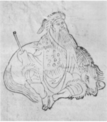
A KITAN TARTAR (14th Century)

In an illustrated Chinese work of the fourteenth century, of which the Cambridge University Library possesses the only known copy, we read that they reached this spot, originally the home of the Su-shen tribe, as fugitives from Korea; further, that careless of death and prizing valour only, they carried naked knives about their persons, never parting from them by day or night, and that they were as “poisonous” as wolves or tigers. They also tattooed their faces, and at marriage their mouths. By the close of the ninth century the Nu-chens had become subject to the neighbouring Kitans, then under the rule of the vigorous Kitan chieftain, Opaochi, who, in 907, proclaimed himself Emperor of an independent kingdom with the dynastic title of Liao, said to mean “iron,” and who at once entered upon that long course of aggression against China and encroachment upon her territory which was to result in the practical division of the empire between the two powers, with the Yellow River as boundary, K'ai-feng as the Chinese capital, and Peking, now for the first time raised to the status of a metropolis, as the Kitan capital. Hitherto, the Kitans had recognised China as their suzerain; they are first mentioned in Chinese history in A.D. 468, when they sent ambassadors to court, with tribute.