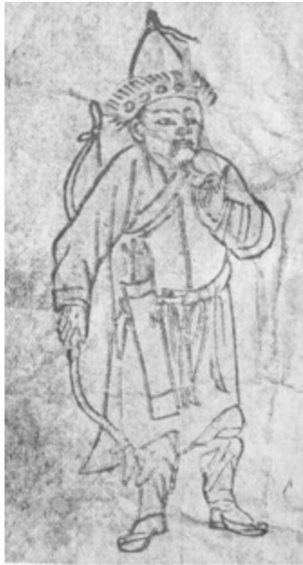
A NU-CHEN TARTAR (14th Century)