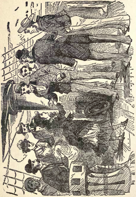
"THE MYSTERIOUS BOTTLE—LITTLE EMILY'S GUESS."—ADV. IN CHINA.— Frontispiece.