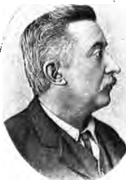
4 Lascadio Hearn