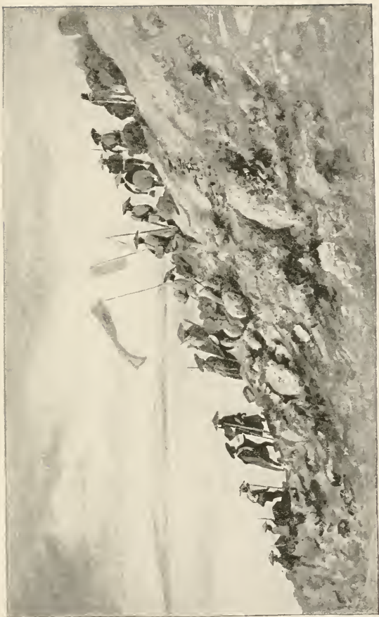
A PILGRIM CLUB ASCENDING ONTAKÉ