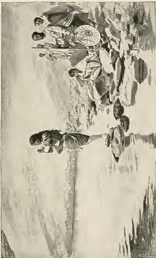
THE LEADER OF A PILGRIM BAND BLESSING THE HOLY WATER