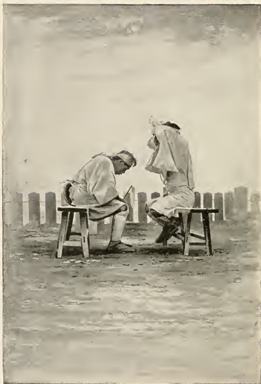
A POSSESSION BY THE GODS UPON ONTAKÉ. Page 6