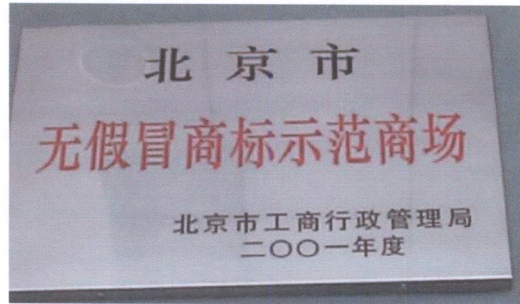
Beijing Administration for Industry and Commerce Sign: "Model Market for No Counterfeit Trademarks, 2001"

Science and Civilization in China. Looking to the future, China has indeed committed significant resources to revamping its laws, establishing a specialized IP court system, implementing specialized administrative agencies with power to fine infringers, and enacting and publicizing laws or measures that may extend beyond TRIPS minima.