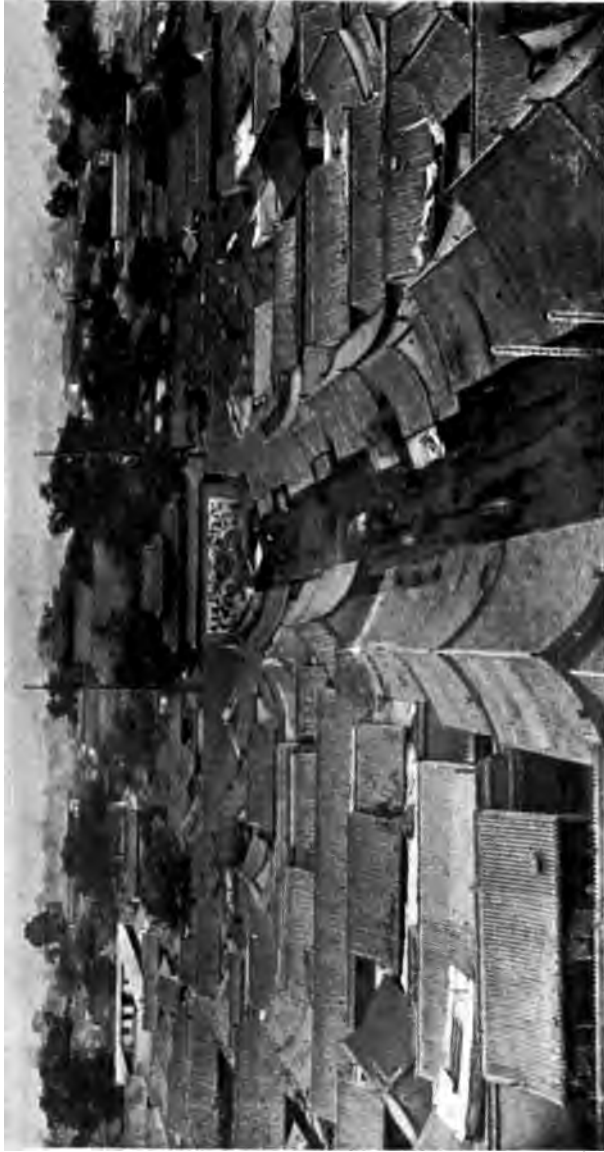
THE GOVERNOR YÜ-HSIEN'S YAMEN AT T'AI-YÜAN-FU, SHAN-SI.

At this place 44 Missionaries and children were put to death on July 9, 1900. (See p. 126.)