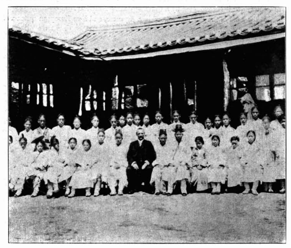
THE GERMAN SCHOOL IN SEOUL.

In passing it may be mentioned that many Japanese board school masters have founded a great number of schools in the interior of Corea, but who pays for their instruction to Corean children is not ascertainable; surely not the Corean Government.