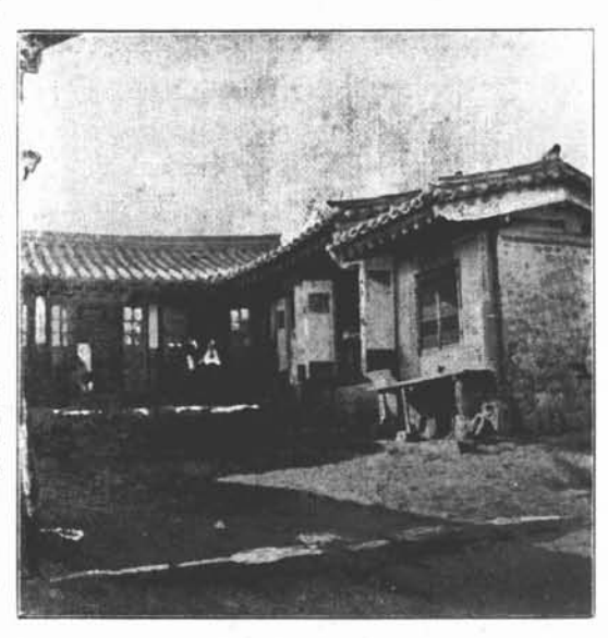
A COREAN SCHOOL HOUSE.

In both schools which I visited the master was already advanced in years; he certainly possessed a pedagogic appearance, in his black cap of office, with immense horn spectacles on his nose, and a thin species of birch in his hand; but he did not appear to devote much attention to the welfare of his