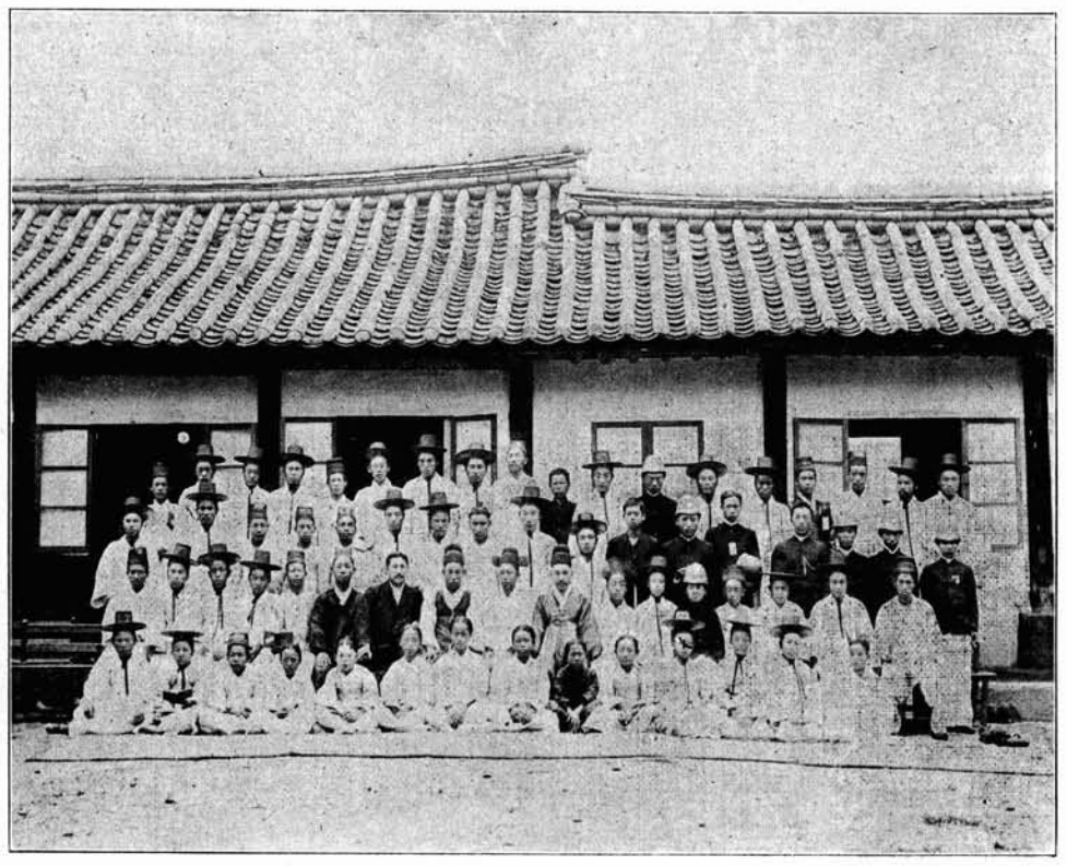
THE FRENCH SCHOOL IN SEOUL.

However, be it noted that merit often counts for little in such cases, the ignorant relative or friend of some Minister being often preferred to the man who has passed all the examinations required. This system of nepotism appears quite just to the average Corean. A few facts may be given regarding each of the various schools of languages.