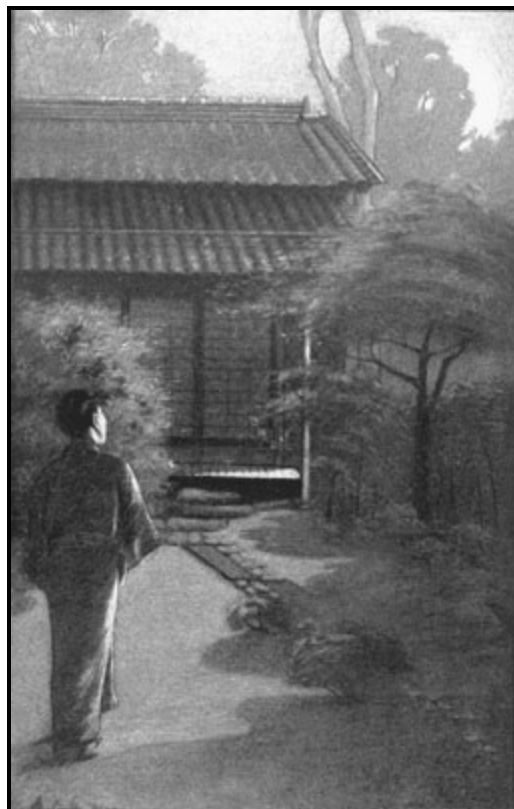
"He walked up and down, sometimes in the narrow room, sometimes in the garden."

Tatsu, unconscious that the house was not still empty, painted on. Sometimes he sobbed. Again an age of beauty caught him, and he needed to hurl himself full length upon the mats until the ecstasy was past. Just as the daylight went he saw, upon the one great glimmering square of silk as yet immaculate, a dream of Ume-ko the Dragon Maiden, who had danced before him. This was an apparition too holy to be limned in artificial light. When the sun came, next day, he knew well what there was for him to do. He placed the frame upright, where the first pink beam would find it. Brushes, water vessels, and paints were placed in readiness, with such neatness and precision that old Kano's heart would have laughed in pleasure. That night the shoji and amado were not closed. Tatsu did not sleep. It was a night of consecration. He walked up and down, sometimes in the narrow room, sometimes in the garden. Often he prayed. Again he sat in the soft darkness, before the ghostly glimmer of the silk, tracing upon it visions of ethereal light. When, at last, the dawn came in, Tatsu bowed to the east, with his usual prayer of thankful piety, then, with the exaltation still upon him, lifted the silver thread of a brush and drew his first conscious outline of the woman soon to be his wife.