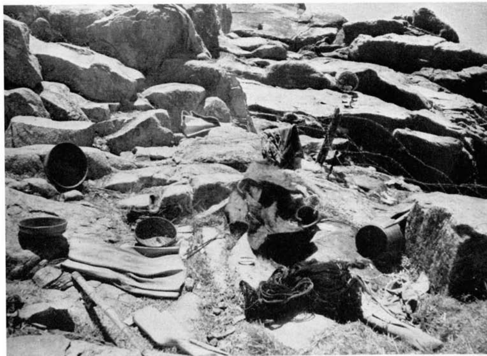
Scattered belongings of the Nanchi islanders left when they were hustled on to the landing craft at Sanchiaoliao