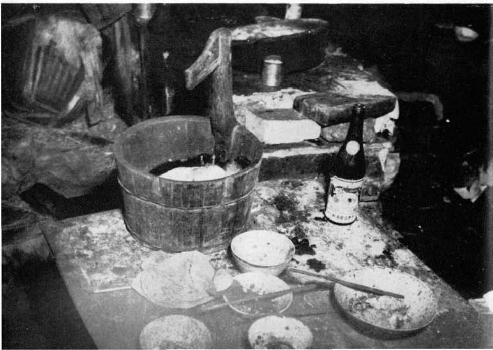
An unfinished meal left by one of the Tachen families ordered to leave while they were still at their meal