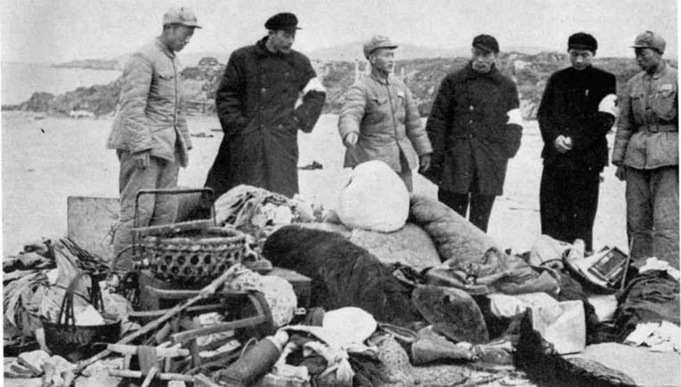
Part of the clothes and belongings which Chiang's forces made the Tachen islanders abandon at the naval drill-ground when they were assembled for embarkation. This drill-ground was one of the main assembly points for the abduction of the islanders