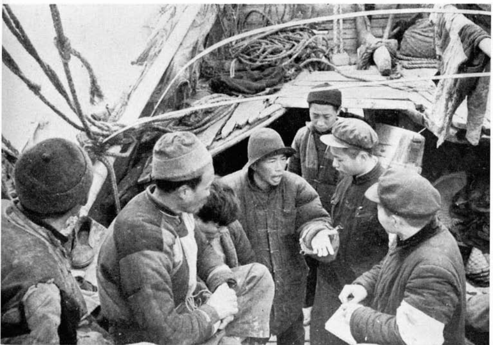
Fishermen giving evidence to the Investigating Commission about the kidnapping of their relatives. These fishermen, who live on the Chekiang coast, were owners of the fishing boat "Hsinlienfa" which was captured with the crew by Chiang Kai-shek forces, and made to go to Nanchi Island. When Chiang's forces retreated from Nanchi 31 fishermen were abducted and the boat scuttled