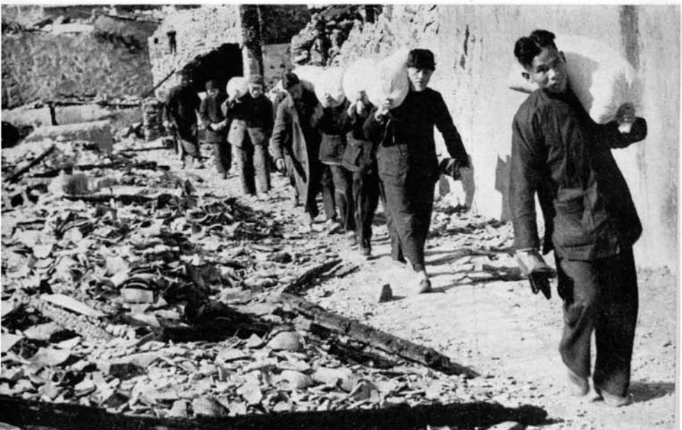
Tachen islanders, who lost everything, carrying home relief rice issued by the Chinese Red Cross Society