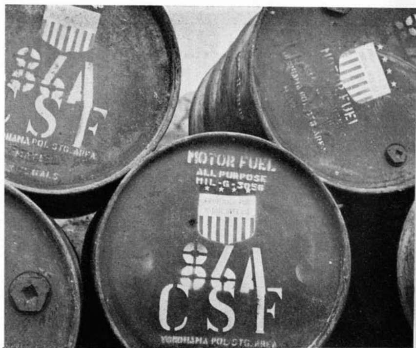
U.S. army petrol drums found on the Tachens