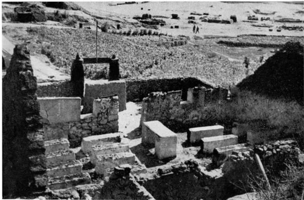
A primary school razed by Chiang Kai-shek troops on Nanchi Island