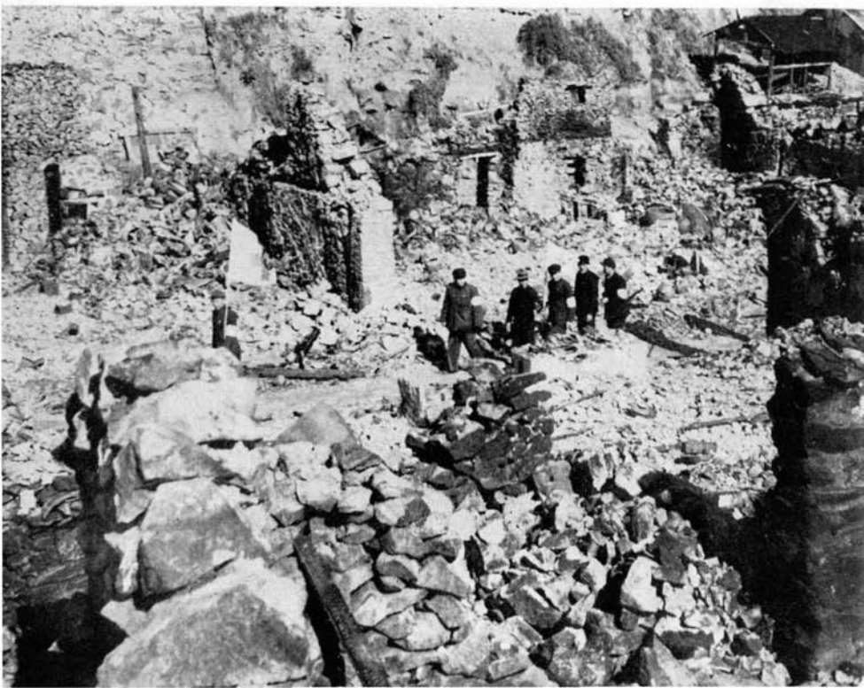
Members of the Investigating Commission inspecting the ruins of houses on the Tachens