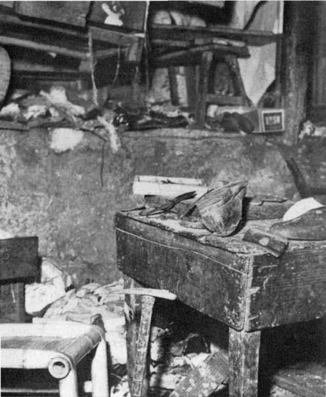
Shop of a shoemaker who was taken away from his work