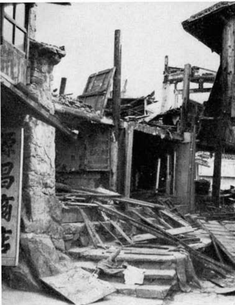
A shop on the Tachens, wrecked and looted by Chiang Kai-shek's troops