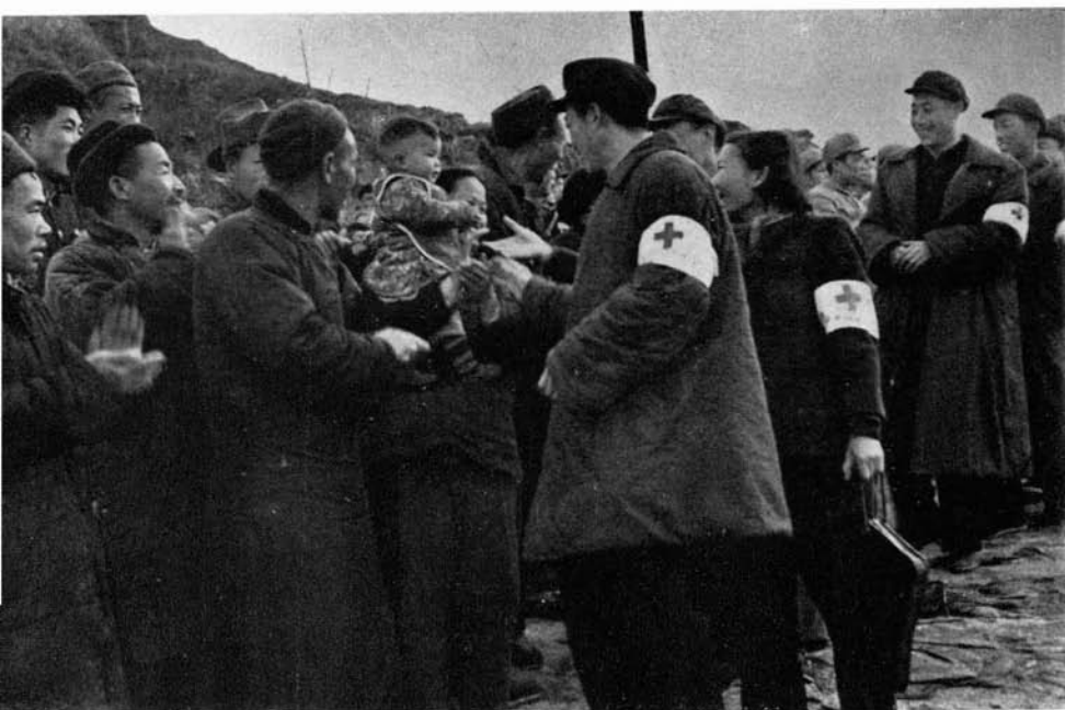
Members of the Investigating Commission of the Chinese Red Cross Society saying goodbye to the Tachen islanders before leaving for the mainland