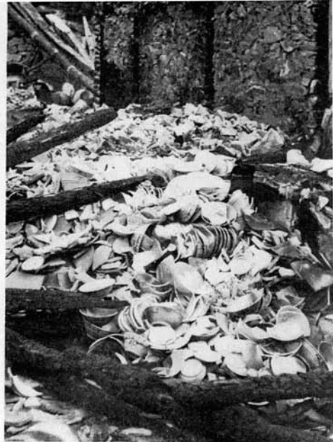
A ruined porcelain shop on Tachen Island