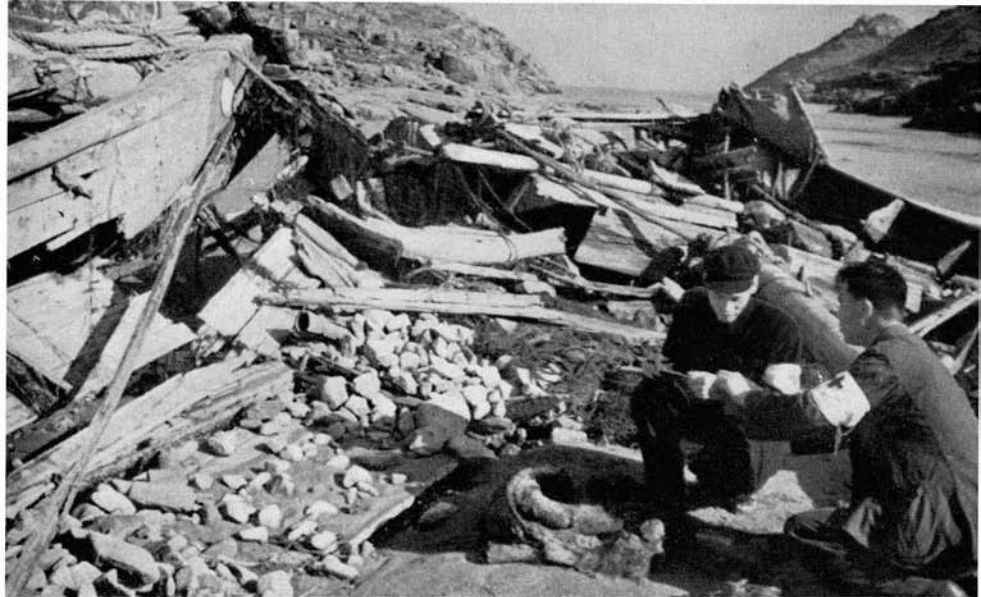
Members of the Investigating Commission inspect pieces of American TNT picked up in these fishing boats wrecked by Chiang Kai-shek troops on Huokunao beach, Nanchi Island