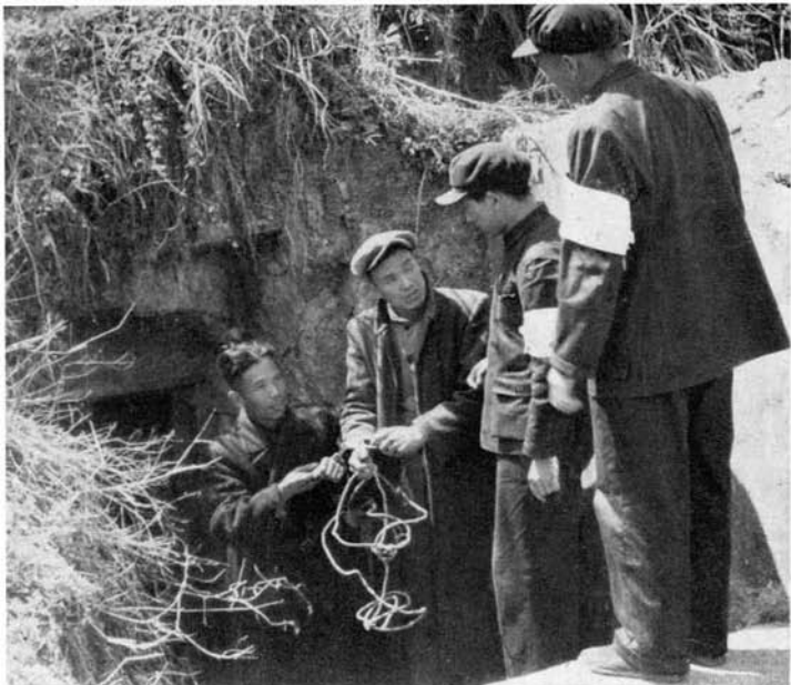
Two Tachen islanders explain to members of the Investigating Commission how they had been arrested and locked up in this dark air raid shelter. Chiang Kai-shek's officials arrested many of the inhabitants and locked them up in order to terrorize the people into going to Taiwan