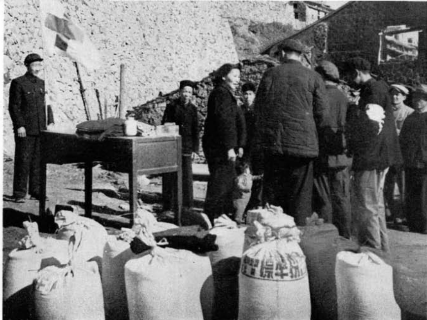
Members of the Investigating Commission of the Chinese Red Cross Society giving relief food and cloth to the Tachen islanders