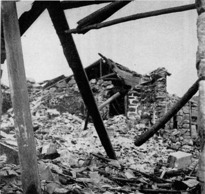
Houses destroyed by the Chiang Kai-shek army on the Tachens