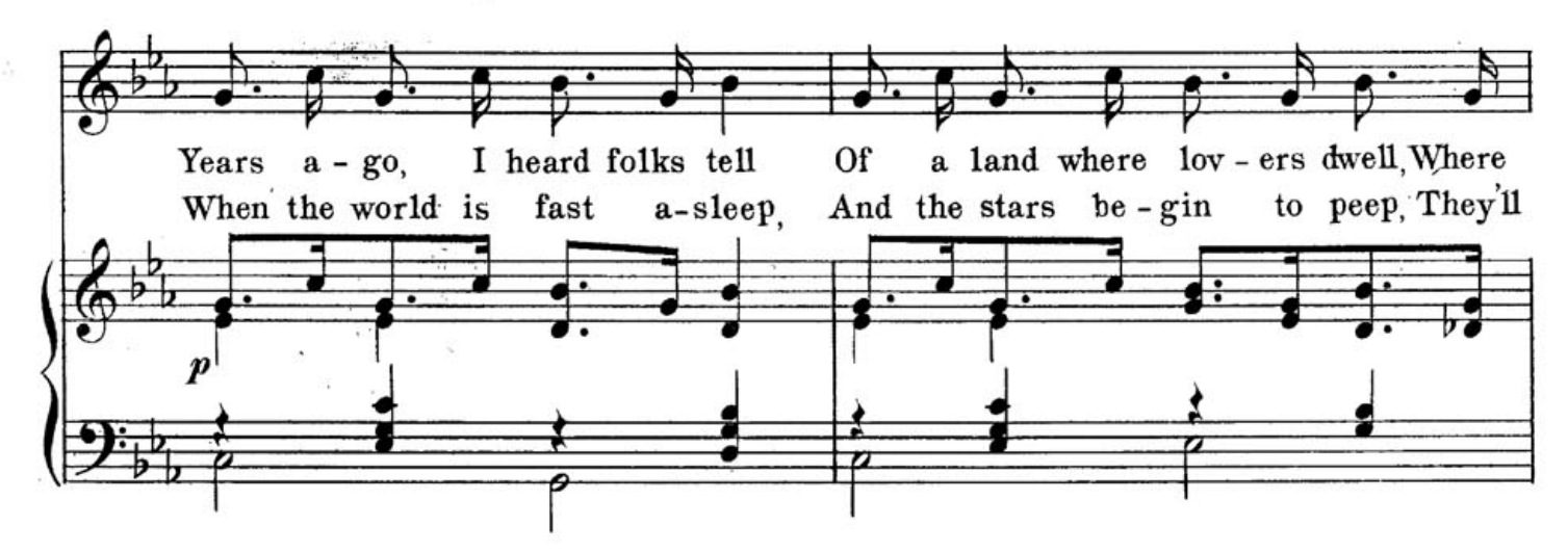
Copyright 1912 by Ted Snyder Co.(Waterson, Berlin & Snyder Co.Prop's.) (112 W. 38 th St.N.Y.) Copyright Canada 1912 by Ted Snyder Co.(Waterson, Berlin & Snyder Co.Prop's.) International Copyright Secured.